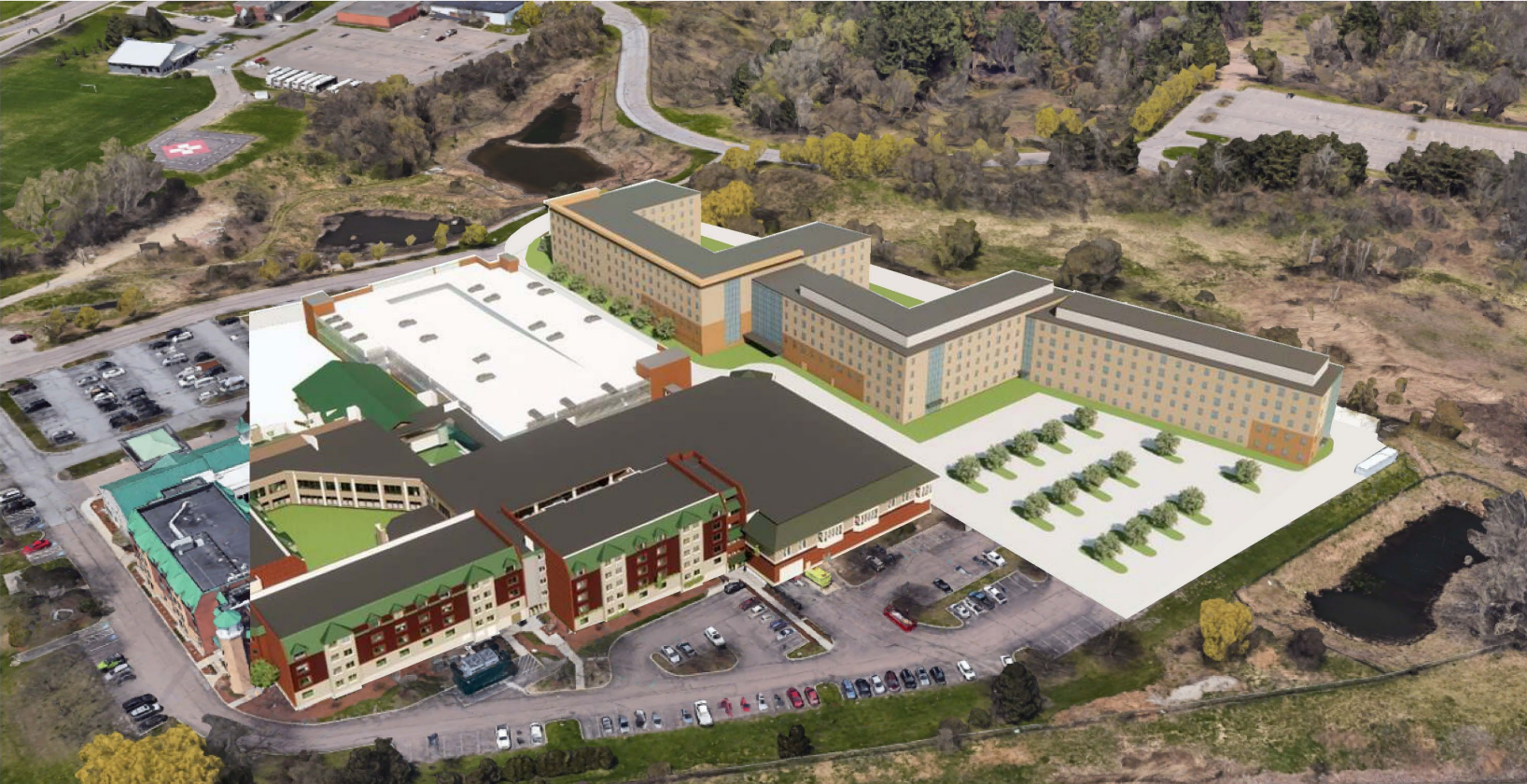
AERIAL VIEW FROM SOUTHEAST